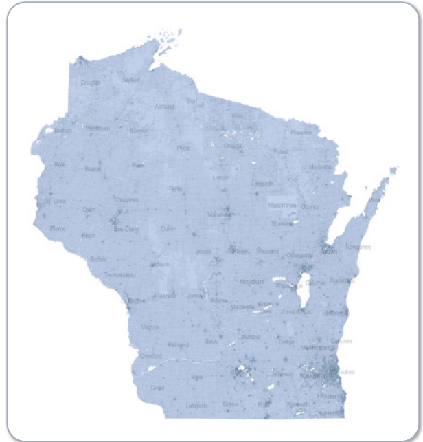
Figure 1. V6 Parcel Coverage (click for larger view)