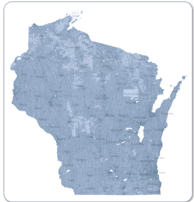
Figure 1. V7 Parcel Coverage (click for larger view)